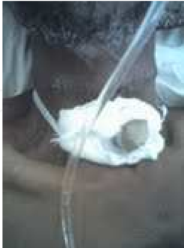
Fig. 2. Repaired cut throat injury.

Some authors are of the opinion that self-harm attempts can be grouped into 'serious suicide attempts' and more impulsive forms of deliberate self-harm. The former is typically associated with severe mental illness, high intended lethality and attempts by the suicide attempter to avoid rescue. The latter is considered a manifestation of personality disorder or acute crisis, where there are impulsive, poorly planned attempts at self harm. This rule of thumb may be misleading, regardless of the potential for death or serious injury in the deliberate self harm category, the rates of completed suicide years after a seemingly minor episode of so called 'deliberate self harm' are significant. This fact is highlighted in a study done in Australia in which 223 patients were followed from 1975 onwards. Of those who had made an attempt at deliberate self harm in the mid 1970's, 4% had completed suicide at 4 years, 4.5% at ten years and 6-7% by 18 years.