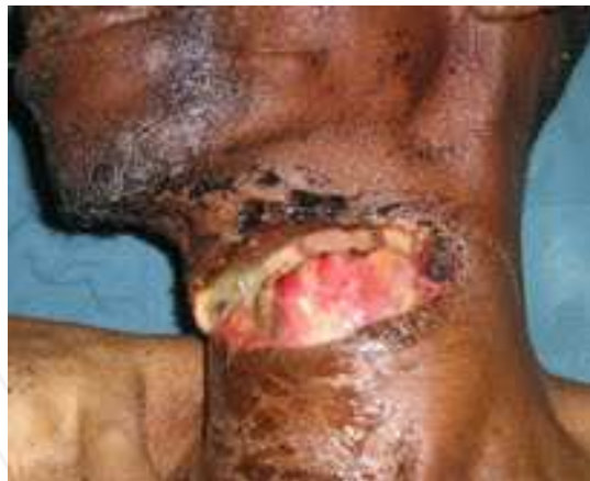
Fig. 1. Infected suicidal cut throat injury at presentation.

In some environment, late presentation is a common feature due to factors like ignorance and of course poverty which may also invariably be the triggering factor for the suicidal attempt. In the event of late presentation, debridement of infected tissues is also done prior to suturing (Figure 1). Debridement may also mean loss of substantial amounts of tissue to effect simple and proper closure. Ideally, pharyngeal, hypopharyngeal and laryngeal mucosal lacerations should be repaired early because the time elapsed before repair of laryngeal mucosal lacerations has an effect on both airway stenosis and on voice restoration 30 . Soft laryngeal stent may be needed for severely macerated mucosa.