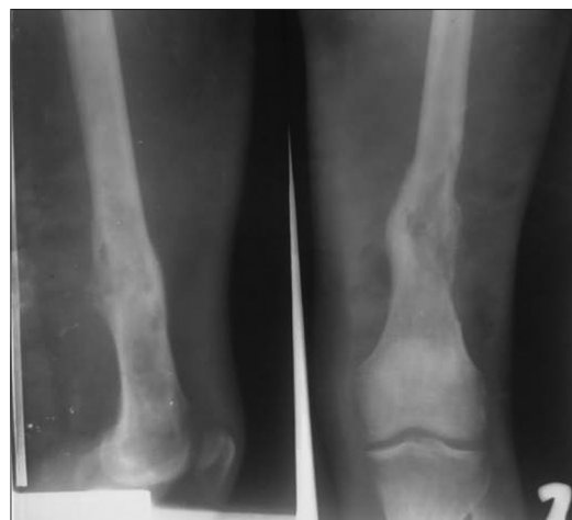
Figure 1: X-ray taken after initial management by traditional bone setters

Most patients with fibro sarcoma are often unaware and present late, with recurrence or large swelling that could be initially mistaken as a benign lesion