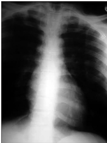
Figure 4: Chest X-ray with cannon ball metastasis

recurrent trauma with associated femoral shaft fracture and metallic implant and the fibro sarcoma is a coincidental finding. We think so although no biopsy was performed at the time of implant surgery because there was no clinical evidence to suggest that as such we cannot rule out the possibility of such incidence.