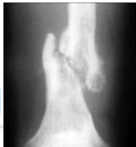
Figure 2: (X-ray at presentation)