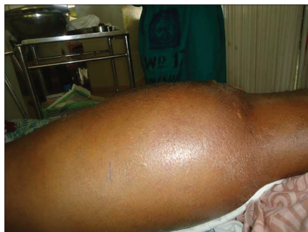
Figure 3: Clinical picture at representation