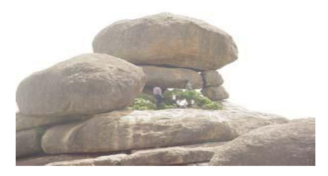
Figure 10: Shere Hill.

The Shere Hills are a range of undulating hills and rock formations with the highest point at 1,829 meters above sea level (Figure 10). These combine together to provide a challenge to mountaineers or rock climbers inviting them to dare the terrain. Located within the area is the Mountain School of Citizenship and Leadership Training Center (Man O' War Bay), a military-type adventure and training for National Youth Service Corps (NYSC) and clubs. It is also very popular with picnickers. Shere Hills is only about 10 kilometers from the heart of Jos. It was host to the First All African Scouts Jamboree in 1976.