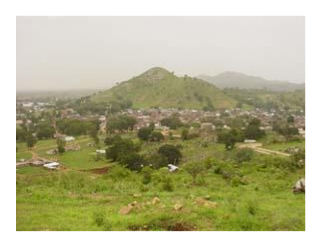
Figure 11: The Pankshin Hilltop.

On a clear day, one can see for several kilometres from this hilltop point. Pankshin Town apparently clings to the sides of the mountain, a part of the world-famous Mesozoic tin-bearing Younger Granites of the Jos Plateau. This picture of Pankshin Township was taken from one of its highest points, the Hilltop Hotel. Pictures really downplay the beauty of this highland town, which is about the coldest major town in Plateau State and is neatly tucked away under some of Plateau States highest land areas.