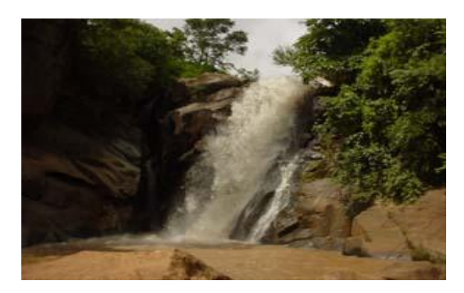
Figure 4: Assop Water Fall.

popular television soap operas and advertisements. It is an ideal spot for picnicking, rock climbing and even swimming. The peaceful environment provides an ideal atmosphere for one to relax while in awe of nature's wonder (Figure 4).