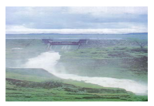
Figure 3: Kurra Water Fall.

Kurra Falls, the home of Plateau State's first hydroelectric power station, is located some 77 kilometers south-east of Jos. This area is well known for its breathtaking scenery. It has pleasant climate suitable for people who cherish beauty and pleasant environments. With its several beautiful island rocks or inselbergs, hills and lakes, the whole area is ideal for boating, camping, and rock climbing, as well as fishing along streams and the lakes (Figure 3).