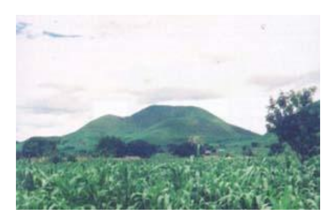
Figure 9: Kerang Volcanic Hill.

Kerang Volcanic hills sites. This rock was created by volcanic activities millions of years ago. No one has any idea how long ago the volcano was active. This is a great sight for anyone interested in the study of volcanology because geologists are unsure if the volcano is still active (Figure 9).