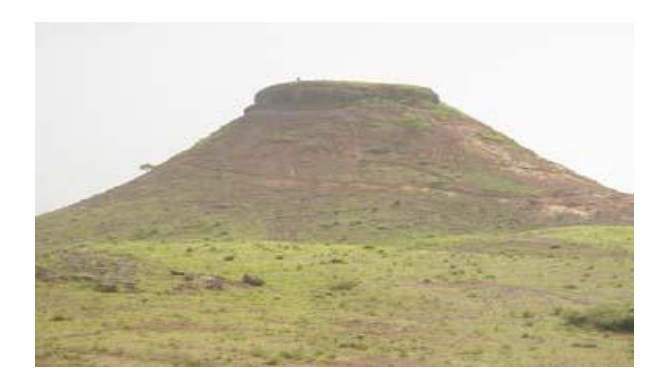
Figure 8: Kwi Conical Hill.

Kwi Conical, The Kwi Conical Hill, in Riyom LGA is one of several picturesque conically-shaped, laterite-topped hills, which occur in several places near the Jos Airport and surrounding areas (Figure 8). It is one of Plateau State's great sights of hills in a rolling virtually flat, un-vegetated area. The hill is a very inviting sight to daredevil climbers who would love the challenge of heights. On top of this hill is an almost flat land.