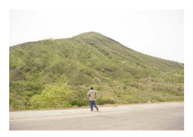
Figure 5: Surra Volcanic Line.

The Luham Rock is located in Tunkus, the capital of Mikang Local Government Area. "Luham" in the language of the local tribe of Montol means "house of water", or simply put, a source of water (Figure 6). The story behind this rock is that back in the dark ages, when people had to protect themselves, the local people had to take cover in rocks and mountains.