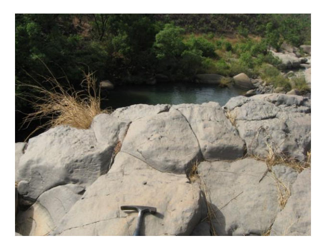
Figure 14: The Yembe Fall Columnar Basalts.

not well formed like those at Kahwang (Figure 14).