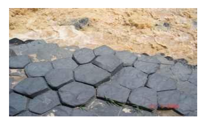
Figure 13: The Gahwang Columnar Basalts.

The Gahwang Columnar Basalts are a rock formation composed of polygonal basalt columns of various sizes and shapes, but in general, most are five- or six-sided, arranged in a very unique fashion as if it were done by an expert mason (Figure 13).