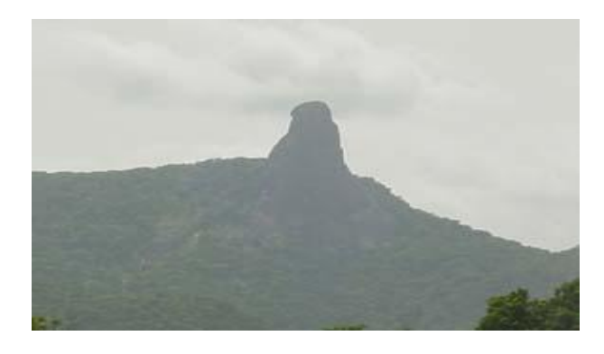
Figure 6: Luham Rock.

The Montol people were fortunate to have discovered this mountain that not only offered them protection, but it also provided them with the most important source of sustenance, water.