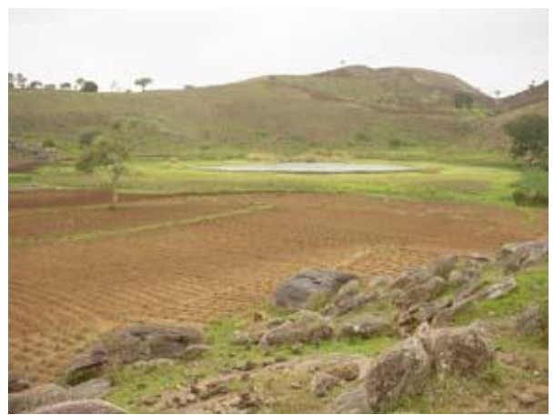
Figure 12: The Pudong Crater Lake.

The Pudong ("Pidong") Crater Lake was created by a volcanic activity and is located in Ampang West in Mangu Local Government Area. This crater lake is a place of great significance to the people that live around it (Figure 12).