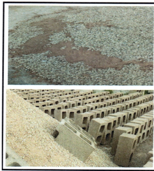
Figure 1. Composition and completion of aggregate filled stone-dust block.

identity, job creation and affordability. The aim of this study, therefore is to determine radiological hazard indices from both ordinary sandcrete blocks and aggregate filled stone-dust blocks produced by major block industries in Jos Metropolis and to assess the level of radiation safety of the users.