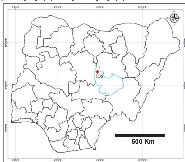
Figure 2. Location of Jos Plateau State Nigeria.

The Jos area is underlain by rocks of the Nigerian Basement Complex, the Younger Granites and the Newer Basalts (Figure 3) Kinnaird et al. (1981). The Basement Complex rock found within the area of interest is mainly migmatite while the Jos Bukuru Complex, the Rukuba Complex and the Shere Complex constitute the Younger Granites suite. The sequence of magmatic events of the Jos Bukuru Complex can be classified into three namely the early granite, the central granite, and the volcanic cycles. The early granite cycle consists mainly of biotite granite, quartz pyroxene fayalite porphyry and granite porphyry.