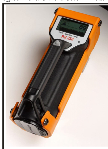
Figure 4. RS-230 BGO Handheld Gamma-Ray Spectrometer.

Measurement of gamma radiation emanating from the naturally radioactive constituents of both sandcrete blocks and aggregate filled stone-dust blocks was carried out using RS-230 Gamma Spectrometer (Figure 4). The spectrometer is a handheld auto-stabilized 1024 channel piece of equipment which uses a large (103 cm 3 ) BGO (Bismuth Germanate Oxide) detector for improved level of system sensitivity and accuracy. The use of a BGO gives very significant increase in performance over the normal NaI detector. A preset time of 120 seconds was used for the measurement per point to allow for better accuracy, while the assay mode provided the concentrations of Potassium (K %), equivalent Thorium (eTh) in ppm, and equivalent Uranium (eU) in ppm for each point of measurement. The energy response of the equipment is 30–3000 kev. Measurement of gamma radiation was carried out on each of the sampled block over a production period of seven (7) days, and the average value for each of the block type calculated. The values were then converted into activity concentrations in Bq/kg with which the levels of radiological hazard were determined.