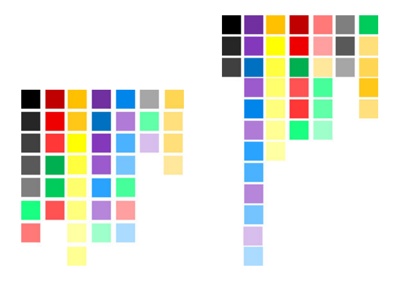
(e) (f) Figure 1: Colour Arrangements by the Participants. Where (a) was the target presented for arrangement,(b) was arranged by A, (c) by B,C,D &H, (d) by E, (e) by F and (f) by G.