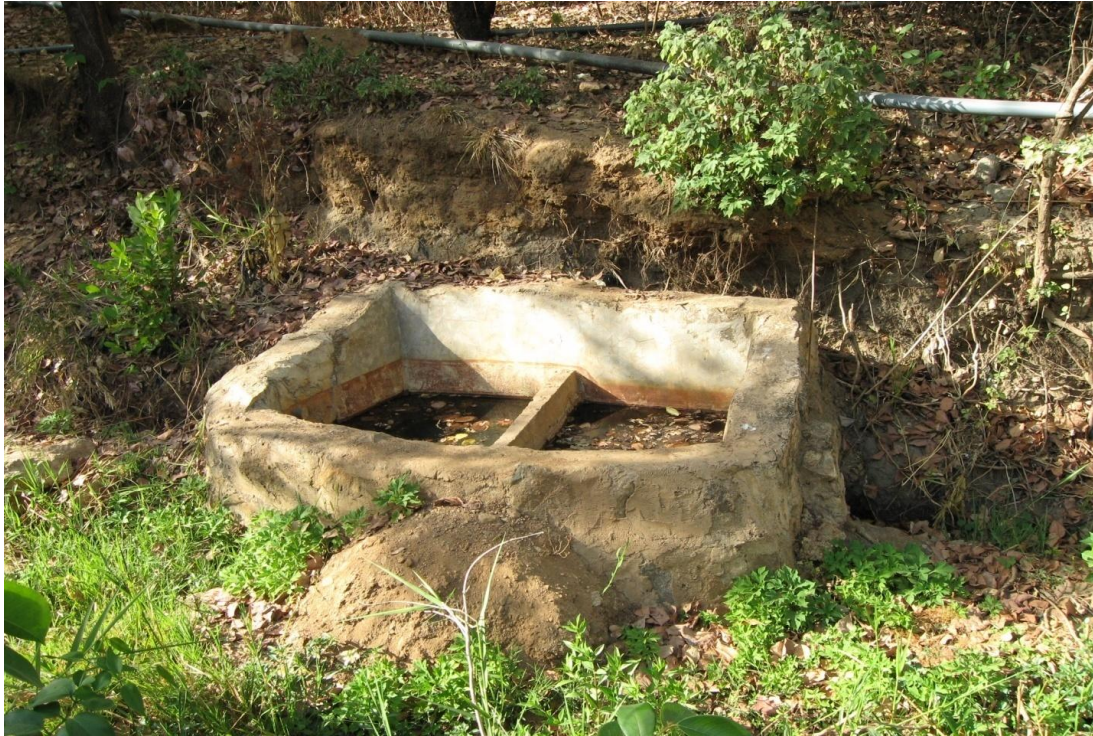
Figure 5: Rhiza Spring Water.