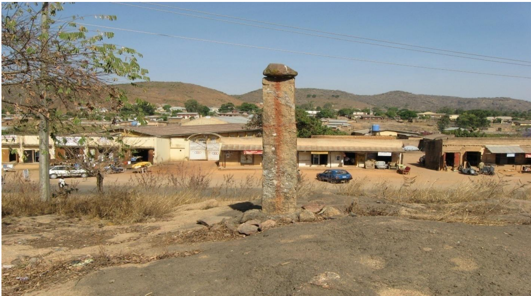
Figure 5: Dogon Dutse ( Usharu Utura ).