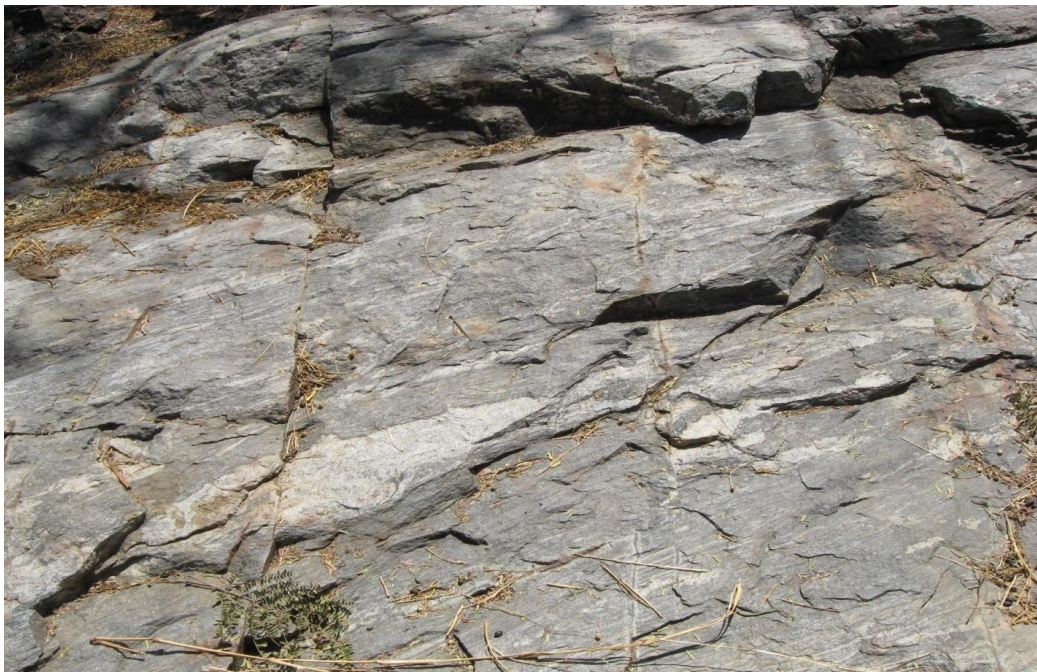
Figure 2: Basement Complex Outcrop at Mazah.