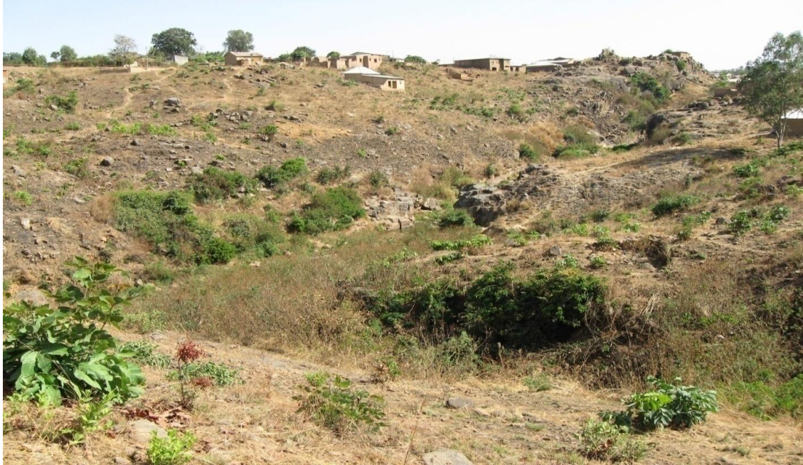
Figure 3: Trellis Drainage Pattern along River Mazah.

The orientation of rock samples and rivers was carried out using a compass and clinometers. Rock samples were obtained with the aid of a geological hammer. Water samples were obtained and stored to avoid contamination. Photographs were taken using a Canon Power Shot ® A570 IS digital camera.